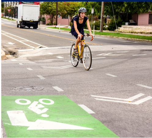
This green pavement marking indicates where a cyclist may wait to complete a two-stage left turn.